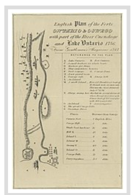
Fortifications at the mouth of the Oswego River

2nd Bn. brought in together with the 1st Bn. in Albany for the winter, primarily at Fort Edward, with companies at Halfway Brook, Fort