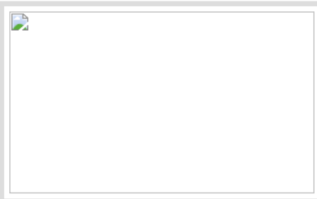
The 42nd at Fontenoy

one of the new companies involved at <u>Battle of Prestonpans</u>. After uprising, new companies serving as Highland watch, and was even ordered to burn and lay waste to houses and property of Scottish rebels.